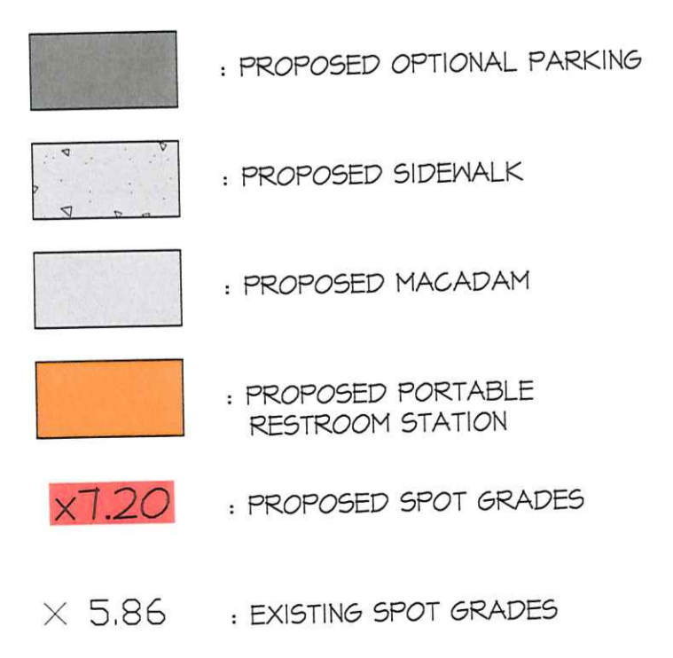
EXHIBIT PLAN #3 CITY OF HAVRE DE GRACE PUBLIC WATERFRONT PROMENADE AT WATER STREET

SIXTH ELECTION DISTRICT HARFORD COUNTY, MARYLAND