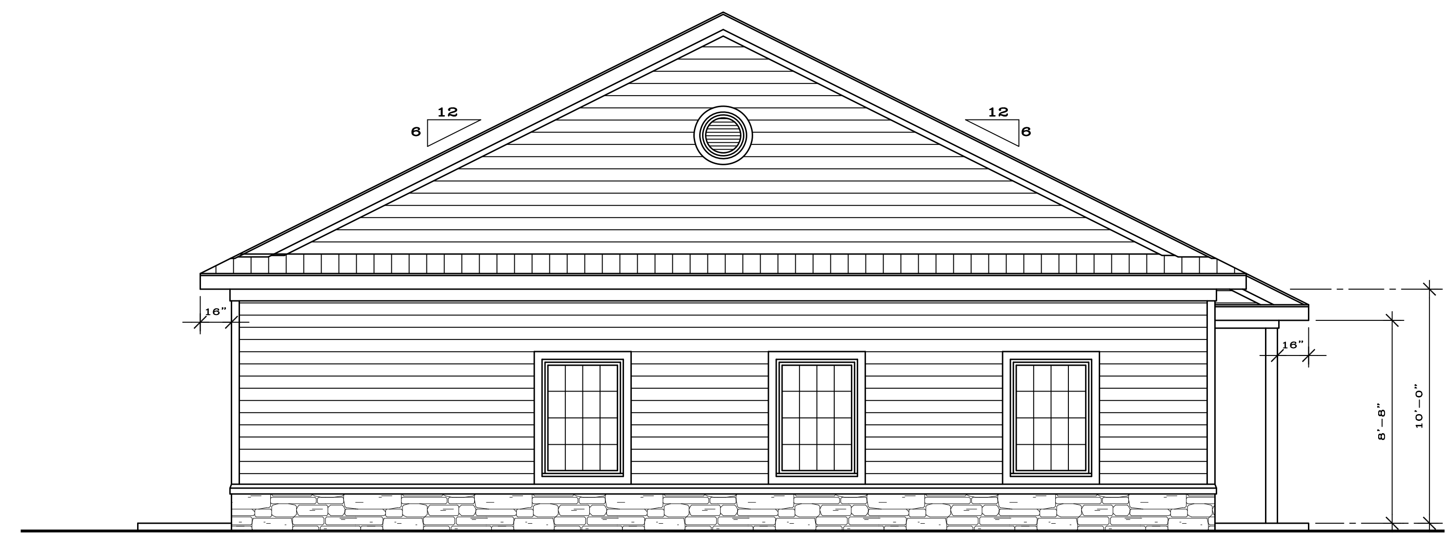
4 A2 LEFT SIDE ELEVATION SCALE: 1/4"=1'-0"

CUSTOMER SIGNATURE: _____ DATE: _____ CONTRACTOR SIGNATURE: _____ DATE: _____