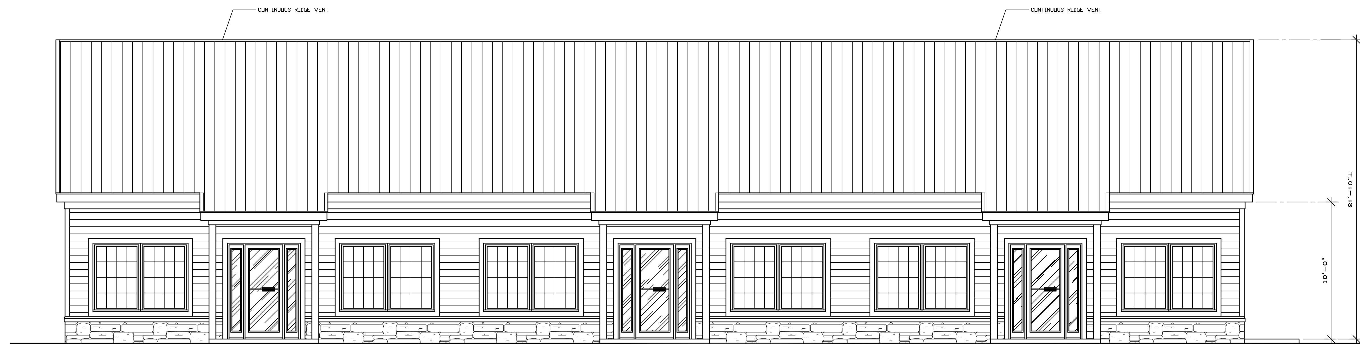
1 A2 FRONT ELEVATION SCALE: 1/4"=1'-0"